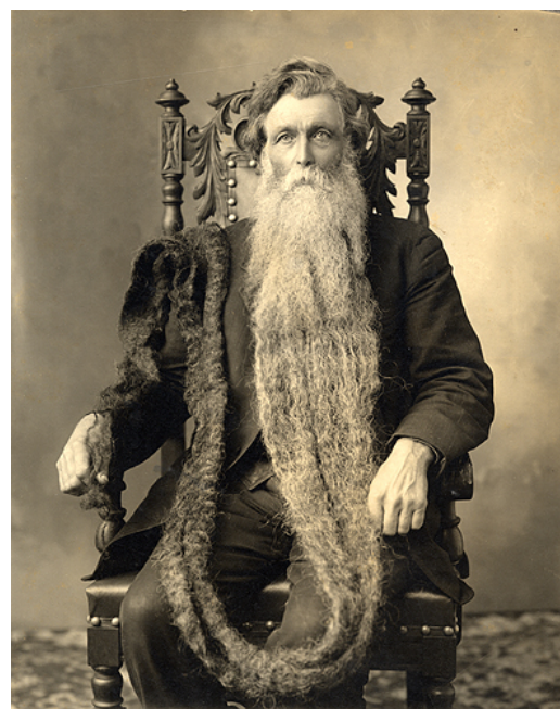
Fig. 476. 100 Centuries ("Sachin Tendulkar")